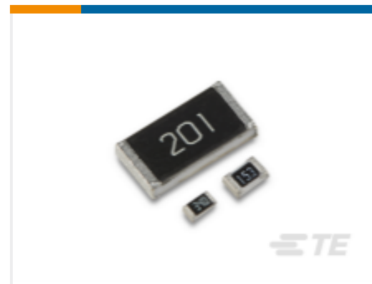
TE Model / Part #5-2176331-9 CRGP 2512 680K 1%