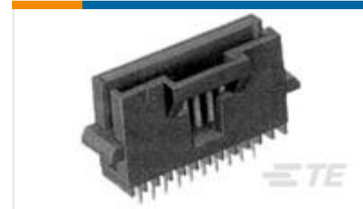
TE Model / Part #104071-8 06 SYSTEM 50 HDR SRST SHRD