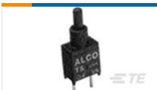
TE Model / Part #1571990-4 TSPD11CGRA004