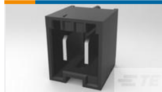
TE Model / Part #1-2232001-2 2P, RAST 5 Tab Header, THV, black, silver