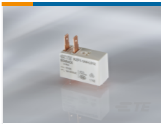
TE Model / Part #1833011-1 STD SCHRACK RZF Power Relays