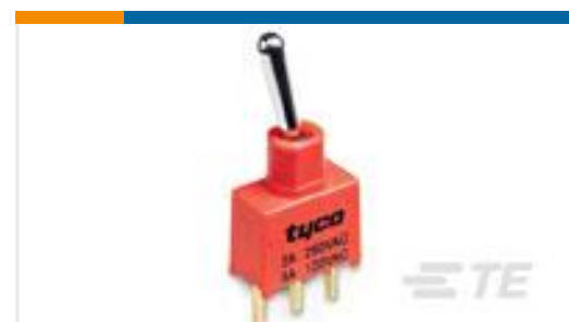
TE Model / Part #1825142-6 AE101MD1AV2Q04