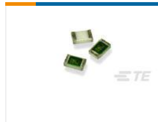
TE Model / Part #7-1879212-5 CPF 0402 13R7 0.1% 25PPM 1K RL W